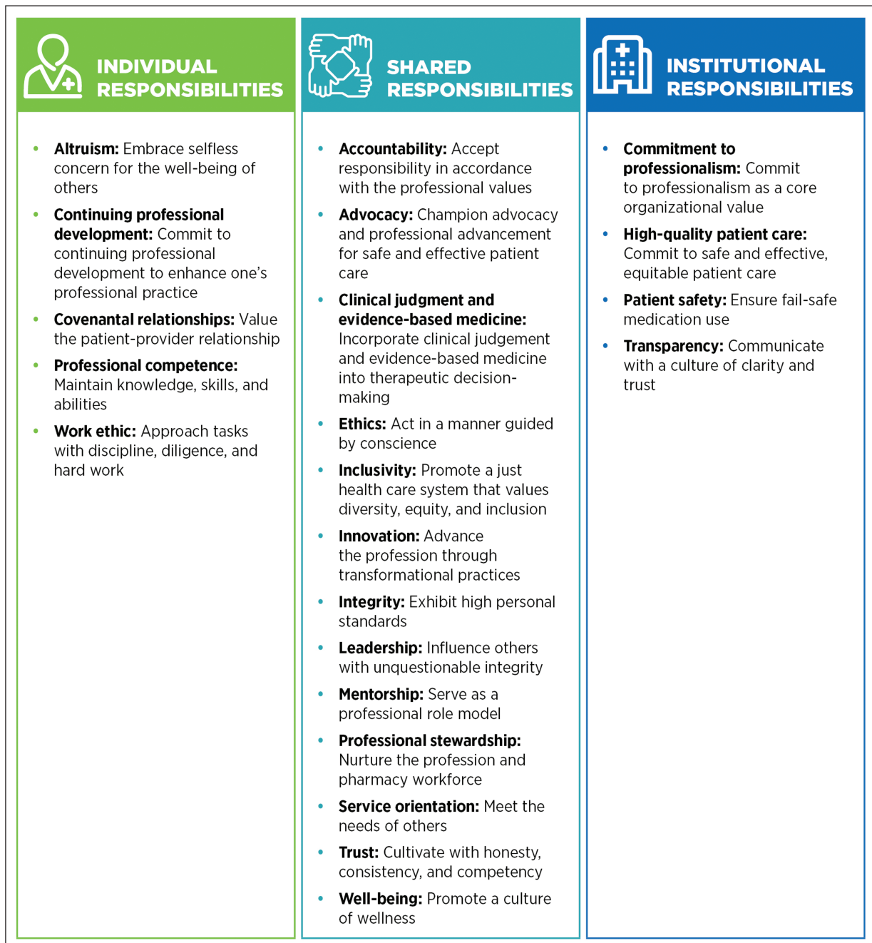
Figure 2. Description of individual, shared, and institutional professionalism responsibilities.

Practicing and aspiring members of the pharmacy workforce should develop a personal plan for continuing professional development, encourage their colleagues to do the same, and share the results. Professional development should be viewed as an opportunity to enhance one's practice and contribute to the advancement of